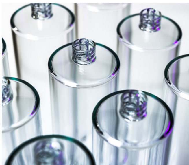
Prefillable syringes Schott TopPac™, manufactured by Schott Glas

For this reason, a number of TOPAS® COC grades have been studied in a biocompatibility test program. The TOPAS® COC grades studied meet the requirements of US Pharmacopoeia XXIII Class VI and ISO 10993. Certificates are available on request.