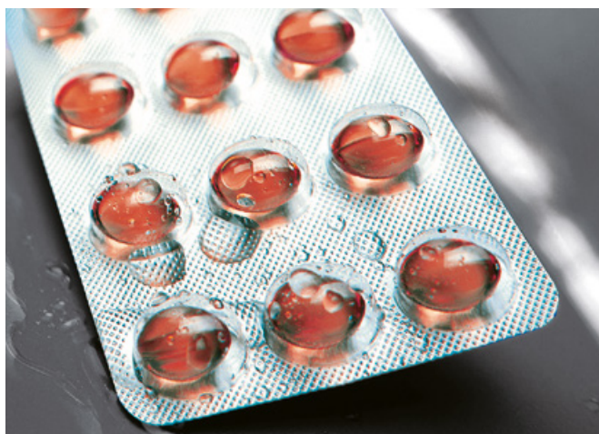
Blister packaging film made with TOPAS® COC

With its remarkable property profile compared with known plastics, TOPAS® COC offers new options for these applications.