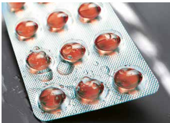
Blister packaging film made with TOPAS

With its remarkable property profile compared with known plastics, TOPAS® COC offers new options for these applications.