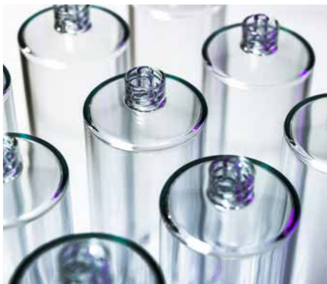
Prefillable syringes Schott TopPac™, manufactured by Schott Glas

For this reason, a number of TOPAS® COC grades have been studied in a biocompatibility test program. The TOPAS® COC grades studied meet the requirements of US Pharmacopoeia XXIII Class VI and ISO 10993. Certificates are available on request.