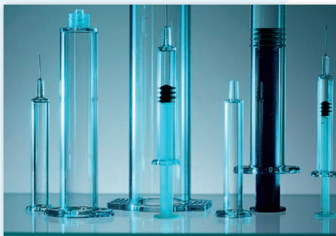
Prefillable syringes Schott TopPac™, manufactured by Schott Glas

For this reason, a number of TOPAS® COC grades have been studied in a biocompatibility test program. The TOPAS® COC grades studied meet the requirements of US Pharmacopoeia XXIII Class VI and ISO 10993. Certificates are available on request.