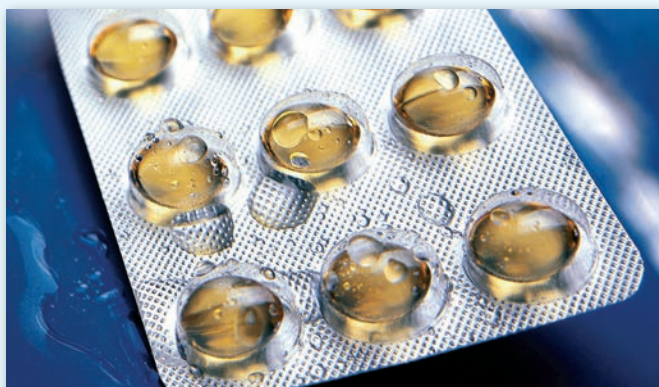
Blister packaging film made with TOPAS

With its remarkable property profile compared with known plastics, TOPAS® COC offers new options for these applications.